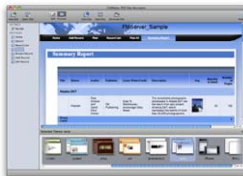
Use built-in PHP Site Assistant themes to create visually stunning websites in minutes.

FileMaker Server 10 provides robust security features to protect your data. Using SSL protocol, encrypt data transferred between hosted databases and desktop clients. Protect sensitive information by filtering the display of hosted database names based on user privileges. And manage user accounts and passwords efficiently through external authentication via industry standard Active Directory and Open Directory.